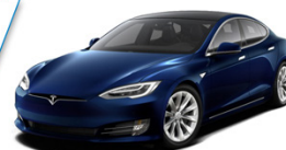
2012 - 2020 TESLA MODEL S