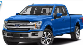
2020 FORD F-150

Complete product and catalog information for the BCA Bearings product line can be found at BCABearings.com and ShowMeTheParts.com .