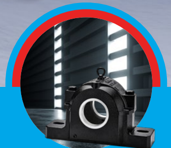
PRODUCT PROFILE SAFD Split Pillow Blocks Faster. Cooler. Stronger. Better. › PAGE / 12-13 /