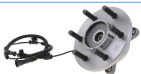
WE61945 - WHEEL HUB ASSEMBLY 336,421 VEHICLES IN OPERATION