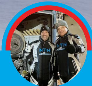
NTN Canada helps Toronto's homeless enjoy a Special Holiday Meal as part of its Happier Smiles Campaign › PAGE / 18-19 /