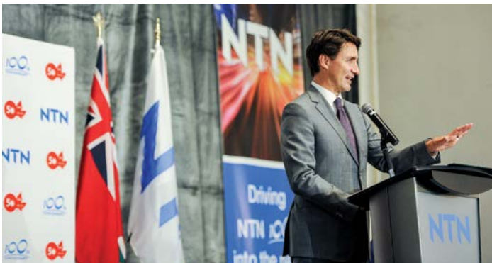
▲ Prime Minister Justin Trudeau addresses the audience at NTN Canada's 50th Anniversary Celebration.

In a speech to hundreds of guests at the Omni King Edward Hotel in Toronto, Trudeau acknowledged the contributions NTN Corporation has made to its community, and cited the company as an example of global success and international investment in trade.